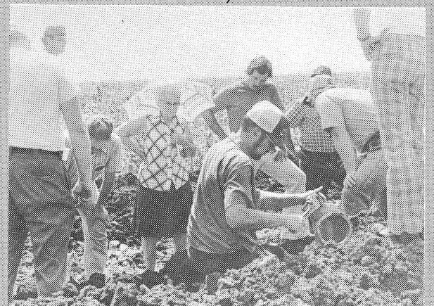
Making a connection.