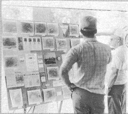
Stan's daughter made the display in which she used aerial shots of several farms on which he installed a system.